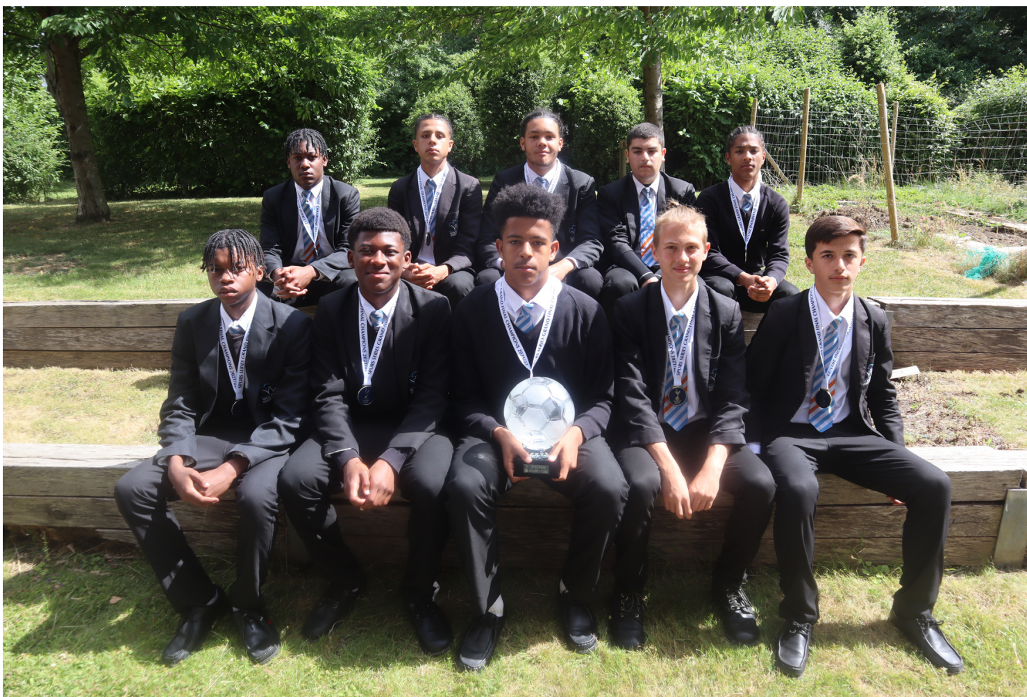
2022 Spurs Series Grand Final Champions

Physical Education at Woodside is a very popular subject in which pupils have access to a wide range of physical activities both in the curriculum and extra-curricular programmes. Pupils have the opportunity to develop their skills as a performer, coach and match official across Key Stage 3 and 4. In addition to this the school has regular opportunities to participate in competitive sport through our inter house sports programme and against other schools in local, regional and national competitions. We strongly believe that there is a sport for everyone and aim to