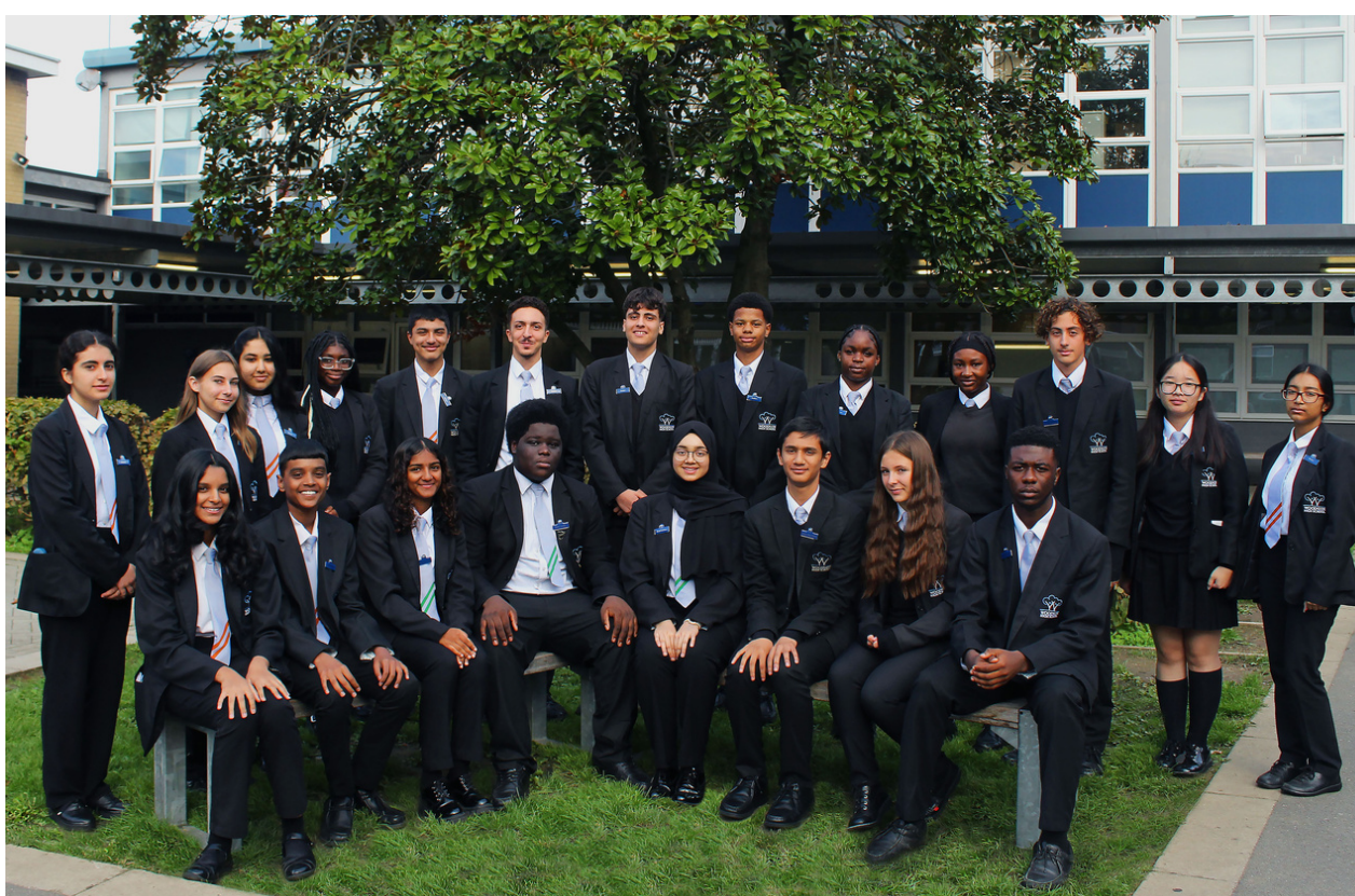
Prefect Team 2022-23

We have the highest ambitions for all aspects of school. We pride ourselves in having a safe and calm school which supports learning and ensures a positive learning environment for all. Our code of conduct clearly sets out our expectations and has a structured system of rewards and sanctions which promote high standards of learning and behaviour both in and around the school premises.