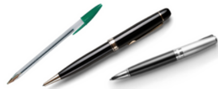
3 Pens (Black x 2, Green x 1)